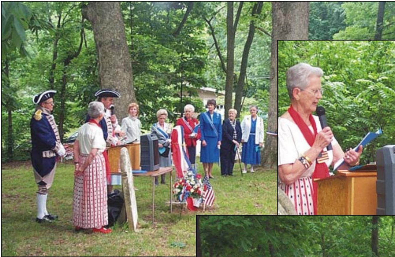
Various SAR and DAR dignitaries speak