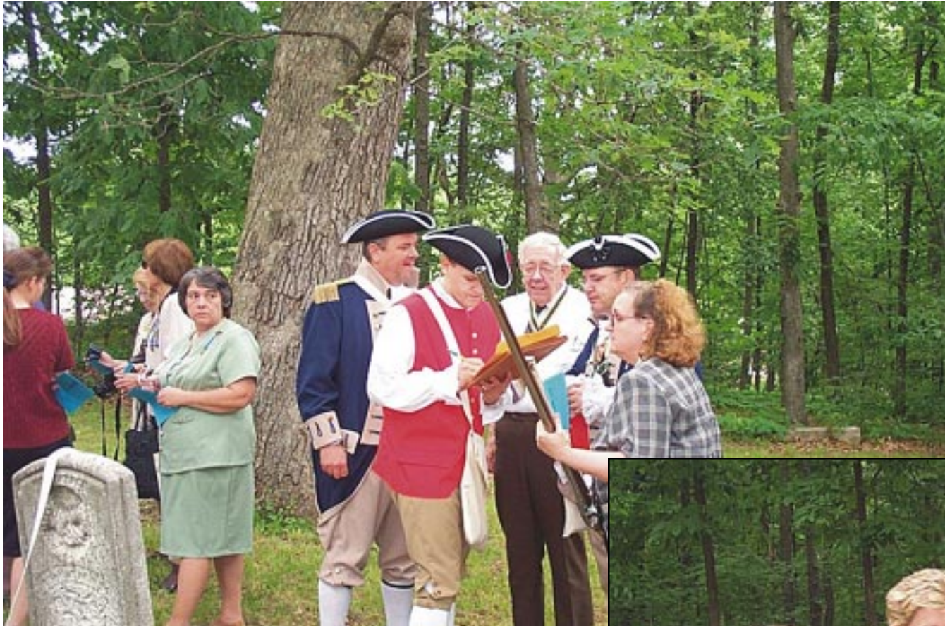
Last minute checking