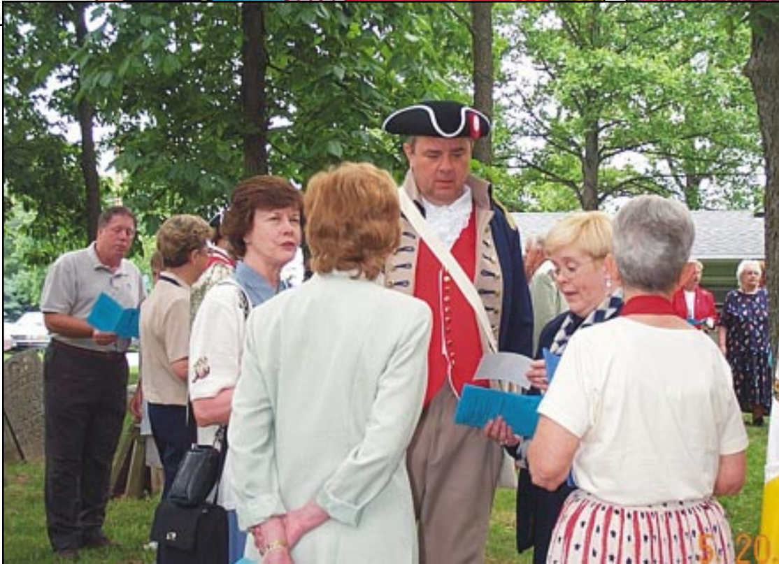
Meeting DAR dignitaries and the lady from Bryan Station in Kentucky